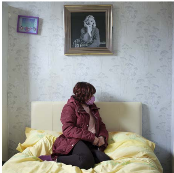
Name Withheld (2022)